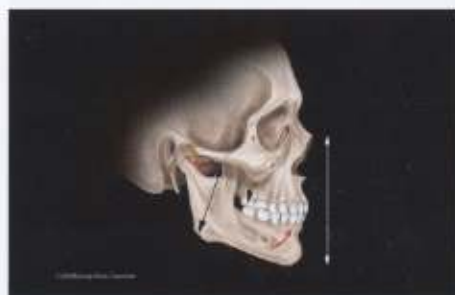
Figure 1: Posterior prematurities can cause the mandible to close in a position forward of centric relation