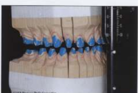
Figure 20: The mandibular preparation model was then mounted against the maxillary preparation model with the first set of bite records

manipulation and a leaf gauge (Long 1970, McKee 2005). Both methods resulted in no reported tension or tenderness and revealed first point of contacts on the second molars, with a forward slide into the maximum intercuspation position.