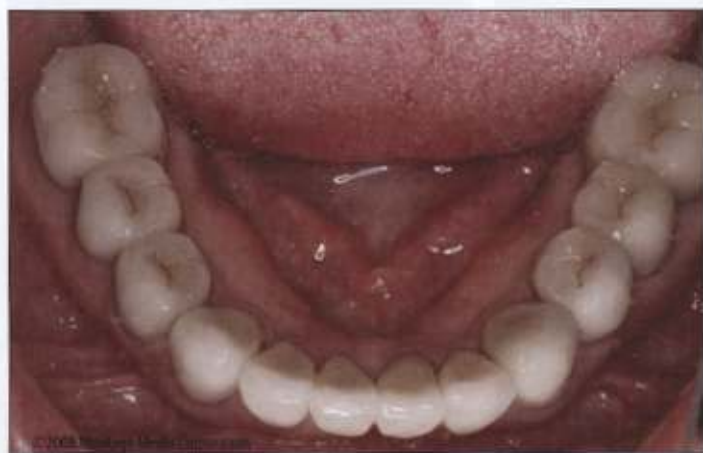
Figure 23: Occlusal view of the aesthetic final restorations seated on the mandibular arch