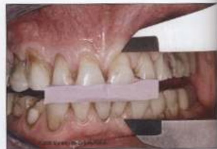
Figure 11: By seating the condyles, a gain of 2.38mm in anterior space was achieved without appreciably stretching the elevator muscles

centric relation position and the teeth come together, the posterior teeth act as a fulcrum that prevents the anterior teeth from touching (Figure 2). This anterior separation may provide enough space for the clinician to restore the aesthetic requirements of tooth length while maintaining a position that allows restoration of maximum intercuspation in conjunction with centric relation (Sesemann 2005).