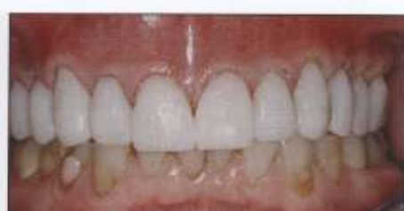
Figure 14: The provisional restorations were placed with petroleum jelly, in order to facilitate simple removal the following day