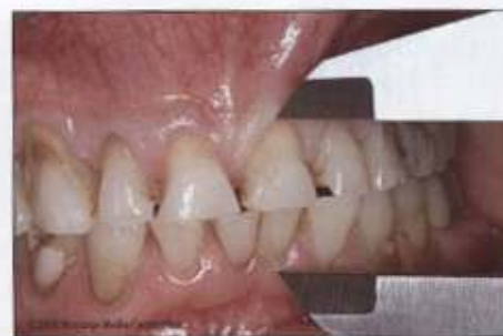
Figure 10: Measurement of the anterior space from marginal tissue of teeth # 9(21) through #24(31) (14.64mm) in maximum intercuspation