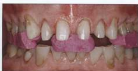
Figure 13: Anterior bite record taken with posterior bite records in place, maintaining the desired centric relation and VDO position