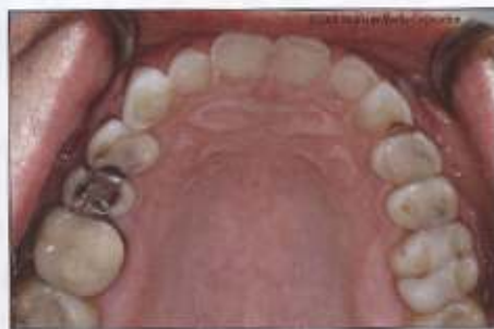
Figure 4: Bonded restorations were present on the lingual aspect of the maxillary anterior teeth, originally placed to restore a combination of attrition and erosion