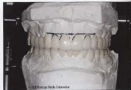
Figure 8: The full-mouth diagnostic waxup took into account that the second molars would be removed and aesthetic crown-lengthening procedures performed