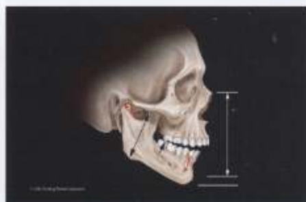
Figure 2: When the condyles are seated in centric relation, posterior teeth act as a fulcrum to prevent contact with the anterior teeth

There is some debate among professionals as to what constitutes the need to open VDO in the restoration of anterior teeth (Spear 2006).