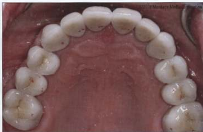
Figure 22: View of the completed maxillary restorations. Guidelines established through provisionalisation ensured minimal adjustments were needed