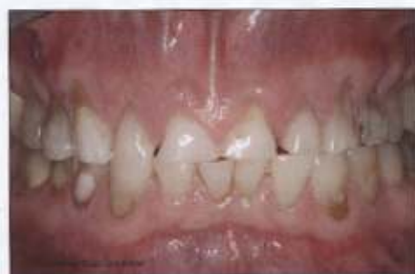
Figure 3: Preoperative view of a patient who presented with severely worn dentition