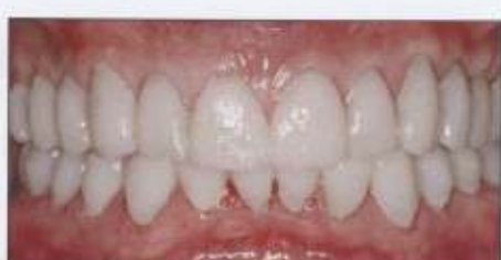
Figure 17: Final provisional restorations fabricated in three sections