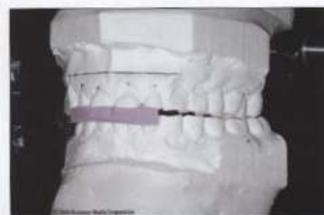
Figure 9: The ceramist fabricated a centric relation anterior index that held the centric relation position at the desired vertical dimension