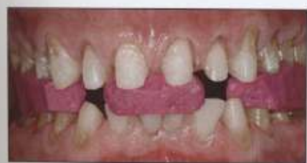
Figure 15: The mandibular posterior teeth were prepared with the anterior bite records from day one in place to hold centric relation and VDO