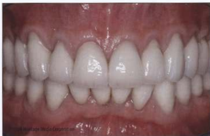
Figure 21: The provisionals were removed and the definitive crowns were tried in and evaluated for aesthetics, occlusion and phonetics