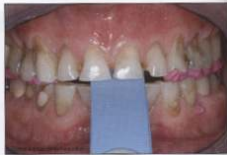
Figure 5: A centric relation bite record was performed with the use of a leaf gauge