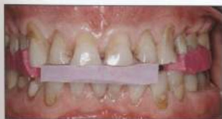
Figure 12: Preparation of the maxillary posterior teeth was performed using the index, and posterior bites were taken