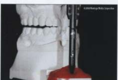
Figure 19: Fabrication of a custom incisal guide table