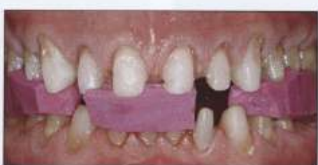
Figure 16: The mandibular anterior teeth were prepared and a new anterior bite record was taken utilising the new posterior bite records to maintain centric relation and VDO