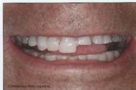
Figure 7: An intraoral composite mockup was performed to establish the ideal length for the central incisors