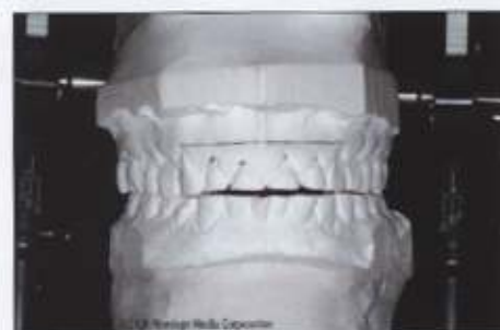
Figure 6: Mounted study casts revealed the second molars to be in premature contact when the condyles were seated in centric relation