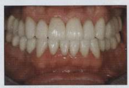
Figure 19. Final restoration, retracted view.