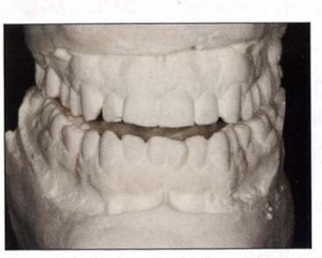
Figure 8. Pretreatment models mounted in centric relation at predetermined desired new vertical dimension.