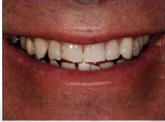
Figure 1. Smile View.

Malocclusions are common. Patients with crowded and rotated teeth, spacing, or a crossbite who are unsatisfied with their appearance may not be interested in traditional orthodontic treatment or surgical correction. Their objections can be related to the length of time needed to complete treatment, or fear of extensive surgery with extended recuperation. When deciding upon treatment, the clinician must understand how the malocclusion affects the patient aesthetically, functionally, and biologically, and the long-term impact of treatment. Many patients may not require treatment. Others may need treatment to improve functions as well as improve the long-term prognosis of the teeth and stomatognathic system. Still others may request treatment based solely on the desire to improve aesthetics. The practitioner must determine the benefits and consequences of each treatment option. It is important to speak with the patient, and