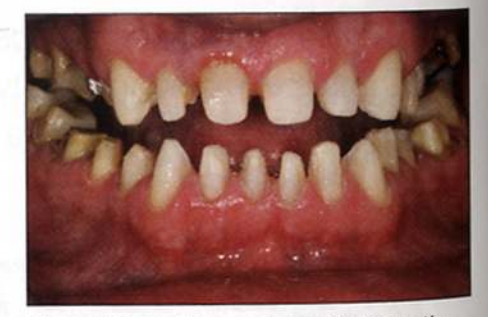
Figure 14. Maxillary and mandibular tooth preparations.

posterior crossbite may be a functional, stable relationship similar to a normal arch relationship, and may not require treatment. Evaluating anterior and posterior crossbites