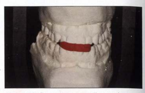
Figure 10. Pretreatment acrylic anterior centric relation jig preparation guide at desired new vertical dimension on mounted models.

When properly treated, crossbite relationships can be very stable, predictable, and maintainable. This is possible because the teeth are not being bodily moved through osseous tissue with retained memory of the periodontal ligament and other structures. Further, stability and maintainability are achieved through stable centric occlusion contacts. Crossbites can be divided into 2 categories: anterior crossbite and posterior crossbite, each with a different set of challenges and considerations. They may or may not occur together, and should be analyzed separately.4 Anterior and posterior crossbites are analyzed separately because they are evaluated by different criteria. Anterior crossbites are evaluated with regard to aesthetics, anterior centric contacts, and anterior guidance. Posterior crossbites are evaluated based on the teeth in relationship to the bone, tongue, and cheeks, and the occlusal relationship of maxillary teeth to mandibular teeth. A