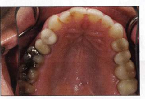
Figure 6. Maxillary occlusal view.