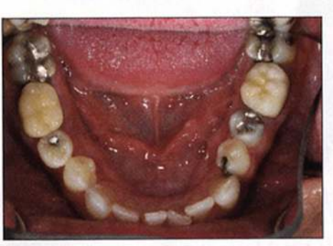
Figure 7. Mandibular occlusal view.