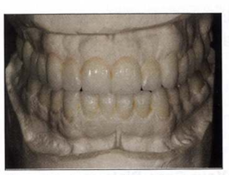
Figure 9. Pretreatment diagnostic wax-up.

revealed an anterior crossbite extending to a posterior crossbite on the left side. A class III cuspid and first molar relationship was present. Skeletal examination revealed a retrusive maxilla and protruded man-