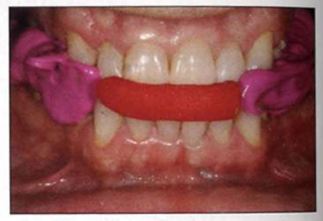
Figure 13. Bite relationship of the maxillary to mandibular posterior prepared teeth.