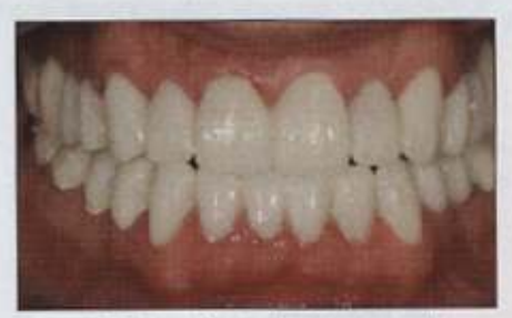
Figure 16. Provisional, frontal retracted view in occlusion.