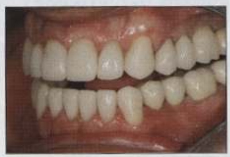
Figure 20. Final restoration, retracted left lateral view

separately may reveal situations where correction of the crossbite (anterior or posterior) is not necessary to achieve the desired goal.