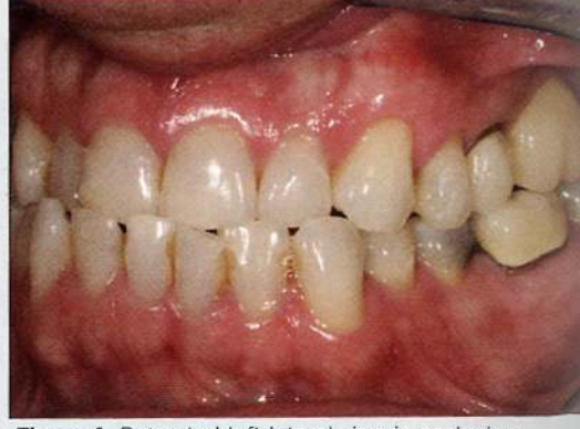
Figure 4. Retracted left lateral view in occlusion.

determine when a noninvasive treatment plan may be optimal.