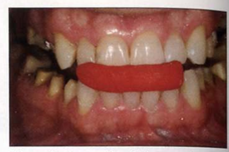
Figure 12. Preparation of the posterior teeth with the anterior teeth completely seated in the jig.