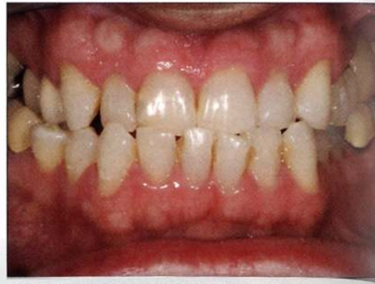
Figure 2. Retracted frontal view in occlusion.