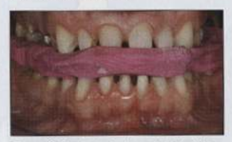
Figure 15. Posterior teeth seated into bite registration. An anterior bite registration is then created, indexing the prepared maxillary and mandibular teeth.