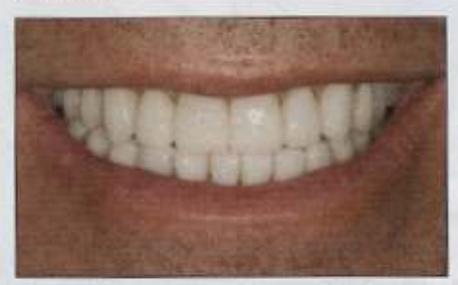
Figure 18. Final restoration, smile view.