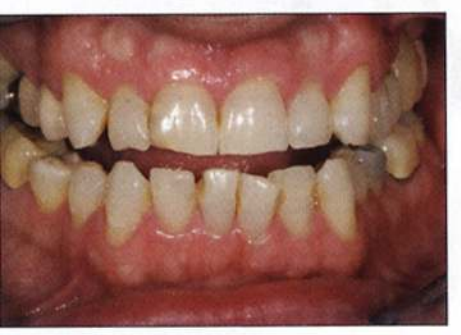
Figure 5. Pretreatment retracted view.