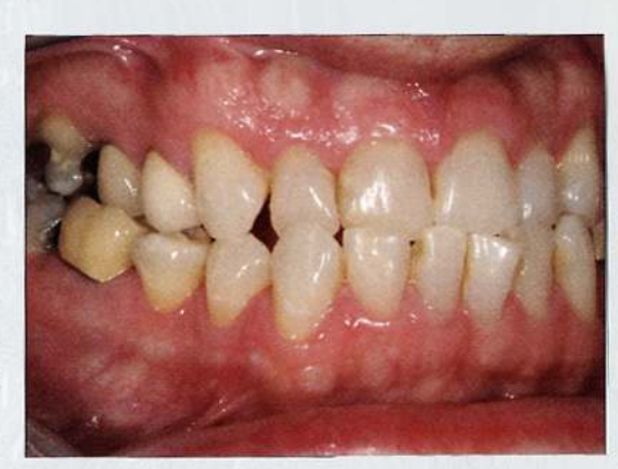
Figure 3. Retracted right lateral view in occlusion.