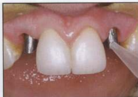
Figure 6. Facial view depicts injection of the provisional material around the prepared provisional abutments.