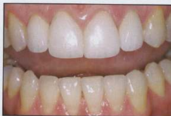
Figure 18. Postoperative view of the definitive implant restorations, all-ceramic crowns, and tooth-whitened anterior dentition.

The utilization of a custom-fabricated provisional abutment and restoration following a six-month period of implant healing can aid in the preservation of hard and soft tissues. In this case, the fabrication of an immediate, customized