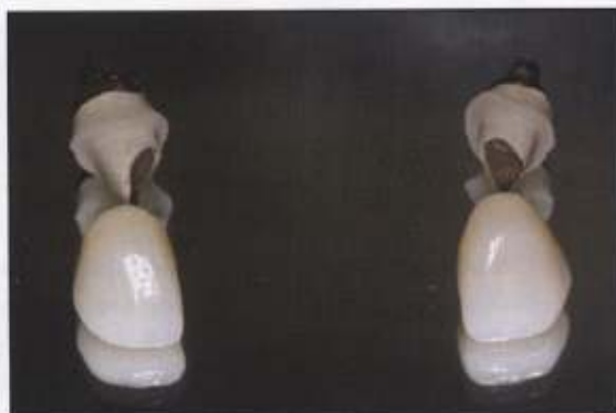
Figure 13. Upon receipt from the laboratory, the definitive abutments and crowns were inspected for accuracy.