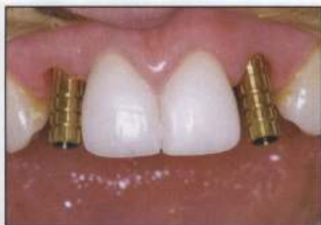
Figure 4. The healing caps were removed, and provisional abutments were placed in site #7 and #10.

restoration on the day of implant surgery. The provisional can be placed at the surgical appointment or the patient can return for it within 24 to 72 hours after surgery. The patient benefits from the immediate aesthetic result that eliminates the need for other forms of removable provisionalization. There are two types of provisionals: 1) laboratory fabricated—whether computer guided or traditionally fabricated with stone and lab components—or 2) custom-fabricated by the clinician. Although a laboratory-fabricated provisional is a viable treatment modality, a provisional restoration customized chairside provides added flexibility in tissue guidance and eliminates additional laboratory expenses. Prefabricated laboratory provisionals, although well planned, may not address the tissue requirements presented chairside. Working with stone models in the laboratory environment, although a good simulation, may not be as accurate as what can be fabricated chairside due to tissue changes encountered as a result of surgery not captured in the pre-treatment stone model.