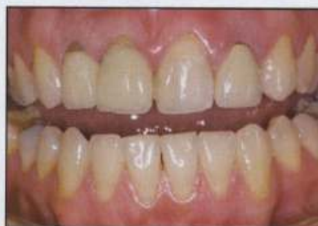
Figure 1. Retracted view of the patient's dentition revealed multiple failing restorations throughout the maxillary and mandibular arches.

Immediate implant placement has been advocated to preserve alveolar height and width since 1989, 7,10 and is recommended for its ability to reduce tissue loss following tooth extraction. 11,12 Utilization of a customized provisional abutment and immediate provisionalization allows for the maintenance of gingival and alveolar structures. They provide optimal aesthetics during the healing phase and the benefit of eliminating the use of a removable prosthesis provisional. The fixed, customized provisional