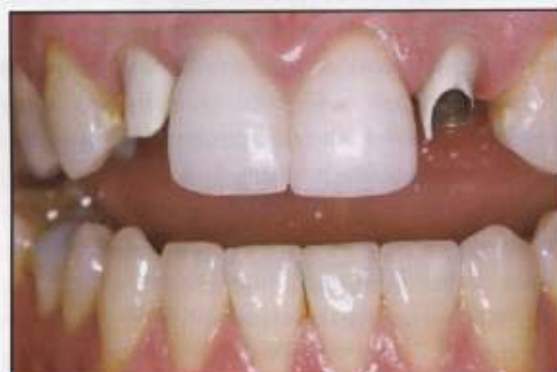
Figure 15. Following successful try-in, a polyvinyl block-out material was placed in the screw access opening.