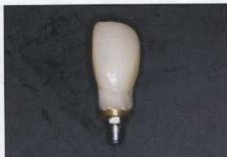
Figure 11. Material was added to the neck of the abutment, which was adjusted until the desired contours were achieved.

second-stage surgery was completed, the patient presented for the final implant-supported restoration of teeth #7 and #10.