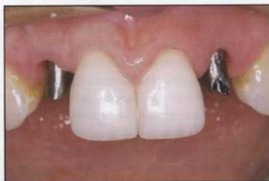
Figure 5. The provisional abutments were prepared to reflect the preparation design required for full coverage of the lateral incisors.

Since implant stability was not achieved at the time of surgery, the removable provisional restoration was adjusted and inserted so as to not traumatize the surgical site. A traditional six-month healing period allowed for osseointegration of the implants. 12,19 Based on the expected definitive restorations' proportions and color,