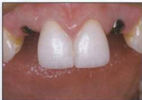
Figure 3. The patient presented with the second-stage healing caps in place approximately six months following implant placement.