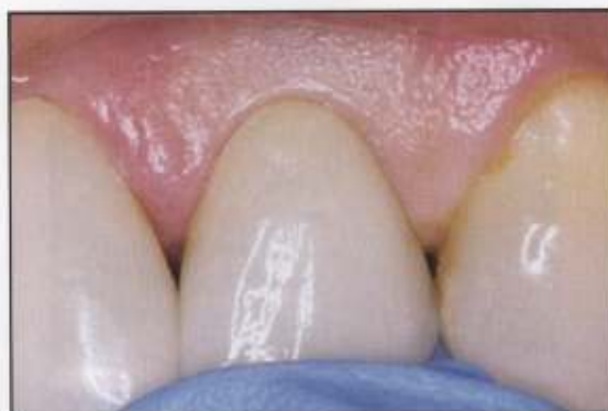
Figure 14. The custom implant abutments and restorations were tried in to ensure accurate fit and aesthetics.