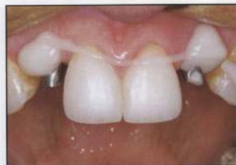
Figure 7. The provisional abutments were covered with a provisional acrylic material, prior to insertion of the putty matrix.