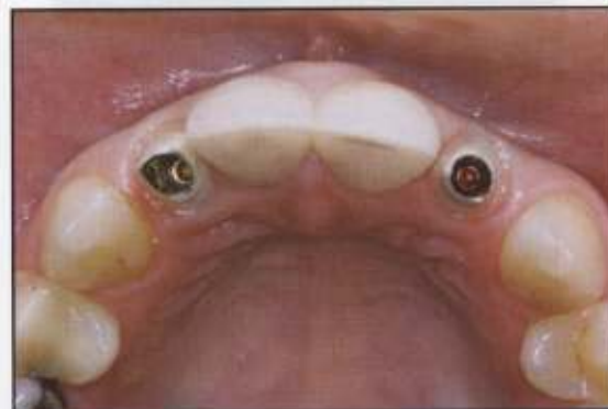
Figure 16. Occlusal view of the final custom abutments seated in proper position for ideal aesthetics and function.

The provisional abutment and restoration were subsequently tried in, and any final adjustments were made for tissue support and emergence profile. The provisional abutment screw was placed and tightened to the proper torque, the provisional restorations were cemented, and the occlusion was adjusted (Figure 12).