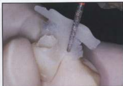
Figure 10. Light-cured composite was used to contour the provisional restoration.