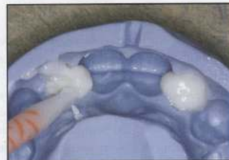
Figure 8. Injection of the provisional material into the putty matrix fabricated from the diagnostic waxup.

the removable provisional prosthesis was created from the diagnostic waxup. Following six weeks of initial primary tissue healing of the surgical site, teeth #8 and #9 were treated with minor laser gingival recontouring to establish soft tissue contour and zenith placement, and the all-ceramic crowns were placed. With the definitive restorations in place, a significant aesthetic improvement was achieved during the remaining five-month healing period and allowed the patient to preview the projected aesthetic outcome. After osseointegration and