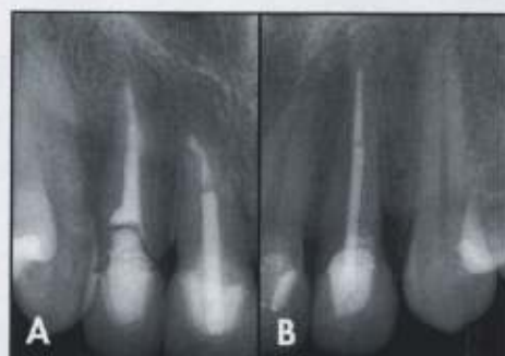
Figure 2A. Preoperative radiograph of the right maxillary anterior regions. 2B. Periapical radiograph of the left maxilla.

restoration will guide tissue growth during the healing phase. 14 If immediate provisionalization is not possible due to lack of implant stability achieved at the time of surgery or the need for guided bone regeneration at the time of placement, the use of a removable provisional prosthesis may be necessary during the initial healing phase. A properly constructed removable provisional prosthesis can also be used as a transitional appliance to guide soft tissue during healing. Once initial healing is complete, fabrication of the customized provisional abutment and restoration can be performed with great success. When it heals, the tissue can be sculpted and the customized provisional abutment and restoration can be fabricated to support the resulting tissue position.