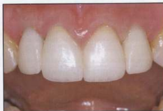
Figure 12. The provisional restorations were cemented in place, and any required occlusal adjustments were made.

The provisional restoration was contoured with light-cured composite, which was placed around the abutment side of the provisional restorations (Figure 10). This process was repeated as each was contoured to create the proper emergence profile. Composite material was similarly added to the neck of each provisional abutment and contoured until the desired contours had been achieved for the provisional abutment and restorations (Figure 11).